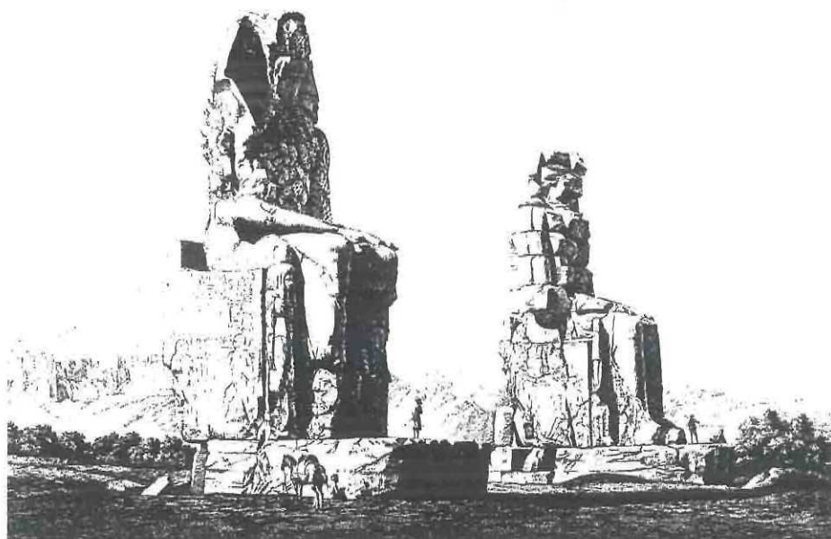
Figure 1. The Colossi of Memnon, from Fagan (1977).

The procedure is not limited to igneous rocks, and can be applied to weathered materials overlying any rock type.